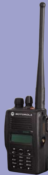
GP388R & GP688R

Compact, limited keypad with alpha-numeric display.