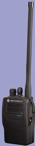
GP344R & GP644R

With the Motorola GP-R Series you can select the most suitable and cost-effective solution for the job with the confidence that full communication compatibility across the range is guaranteed. Whether it is simple "talk and listen" functionality or a more sophisticated requirement allowing the user to manage teams and production the GP-R Series fulfils the need.