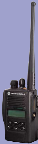
GP366R & GP666R

Compact, limited keypad with alpha-numeric display.